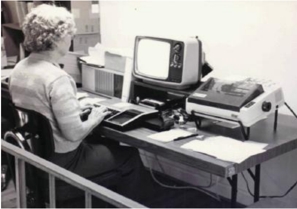
A volunteer posting grades on old system about 1995

----- Cut here and return with your gift -----