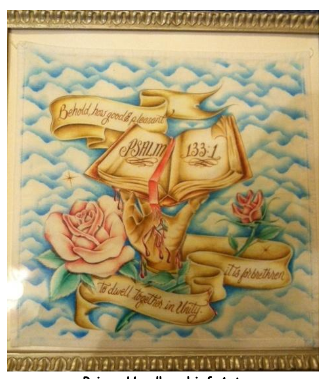
Prison Handkerchief Art